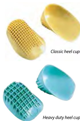
Classic heel cups